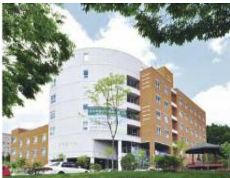
Education Research Institute

The Education Center for Early Childhood was established in 2012 to develop research on early childhood education and support high quality practices of early childhood education out in the field, implementing early childhood education that is appropriate for the future. In 2015, it was selected as the college research institute of humanities and social sciences for promoting various research projects. It provides an opportunity for the children to experience nature through the environmental education program centered around endangered animals, educates the parents on early childhood education and parent education and trains the teachers with customized programs that support early childhood education research and education practice. The Education Center for Early Childhood provides a new paradigm for the future of early childhood education.