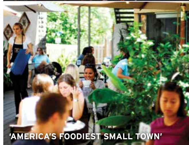
'AMERICA'S FOODIEST SMALL TOWN'