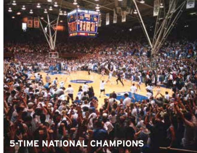
5-TIME NATIONAL CHAMPIONS